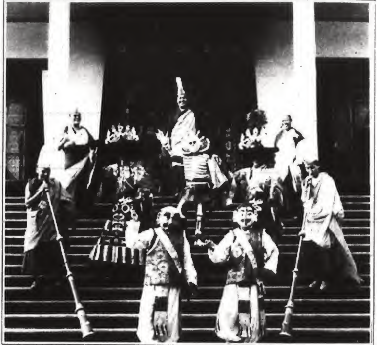
TIBETAN MONKS share sacred dances and music for world peace and healing.

Fine Arts season tickets may be purchased for $20 for students, $25 for senior citizens, $30 for adults and $60 for the entire family in 102 Fine Arts. Individual performance tickets are sold at the door for $7 for students, $10 for senior citizens and $12 for adults.